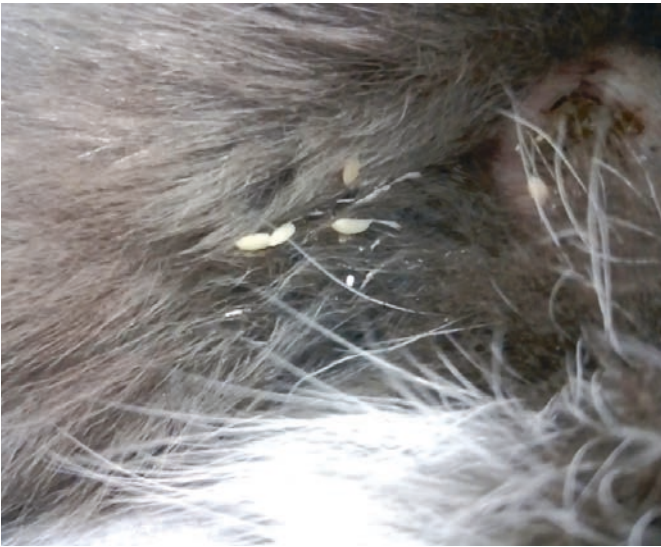
Dipylidium caninum proglottids in the perianal region

Visual observation of proglottids in cats harbouring cestodes is not a reliable detection technique 10 .