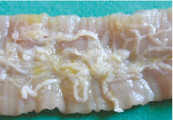
Dipylidium caninum in cat intestine

Direct tapeworm recovery at necropsy examination is the most accurate method to estimate the real prevalence of cestode infestations... but is only possible in specific conditions (shelter, stray cats or wild felids).